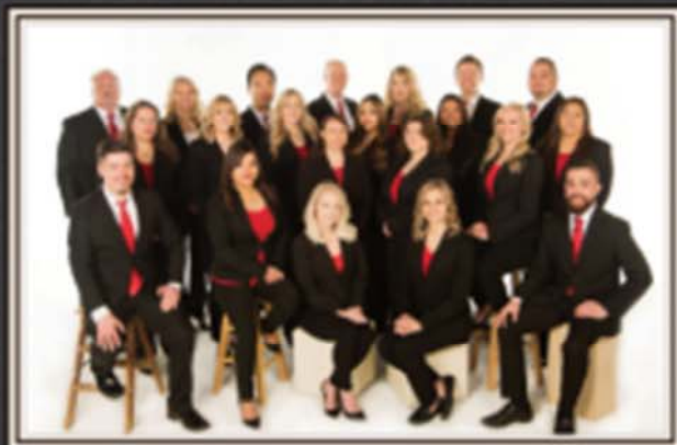
Cassady Law Offices, P.C.

Estate Planning For: Law Enforcement Firefighters Active Military